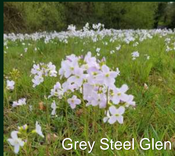
Grey Steel Glen